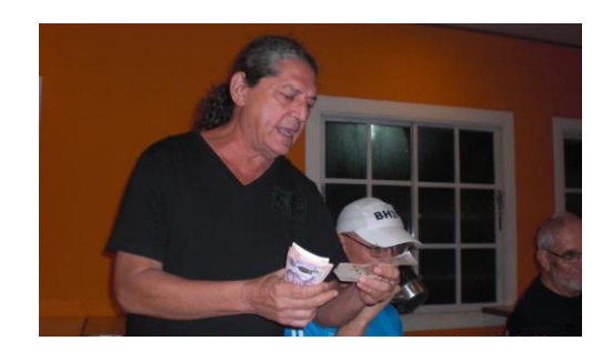
Someone's got it in for me – they're planting stories in the press