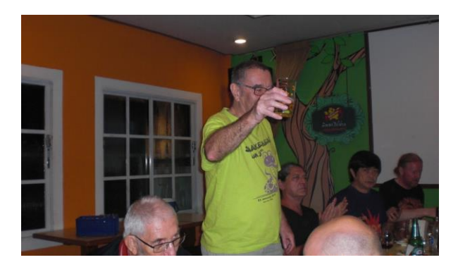
I started out on Burgundy, but soon hit the harder stuff