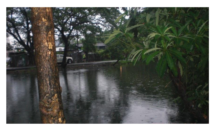
Hard rain falls on Tambourine Man's run