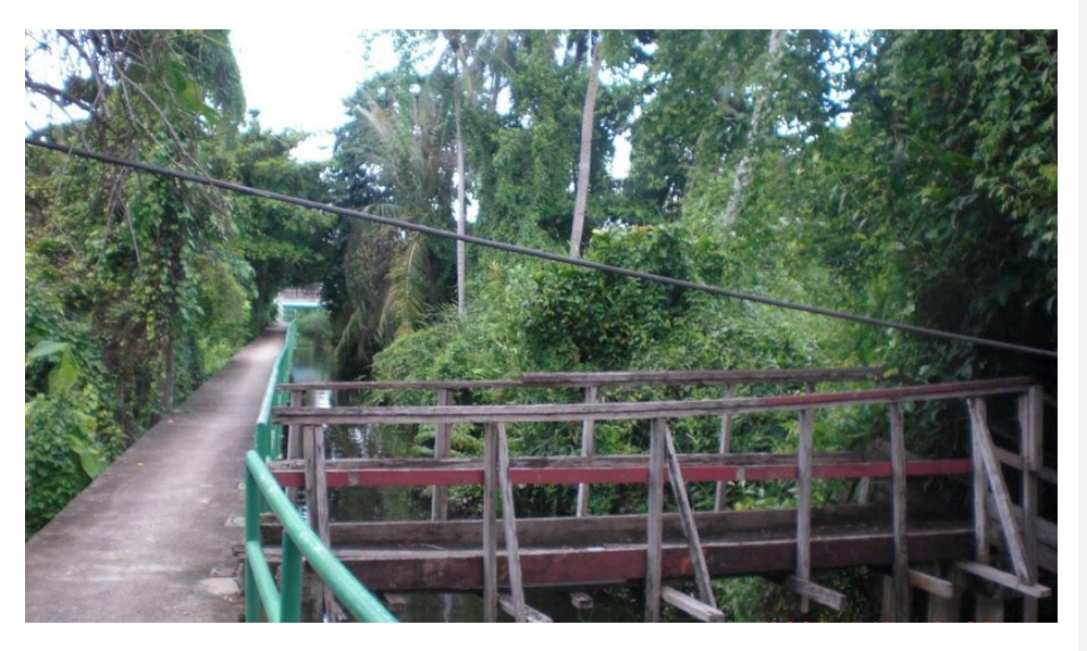
A nice stretch with no paper - after a local householder scolded the hare.