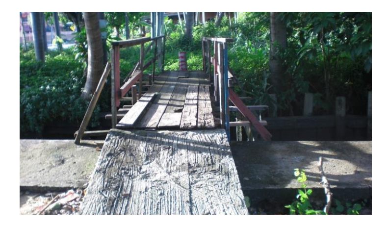
The sun shines bright on Bullitt Bridge