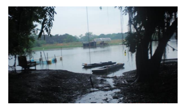
I'm sailing away my own true love, I'm sailing away in the morning.